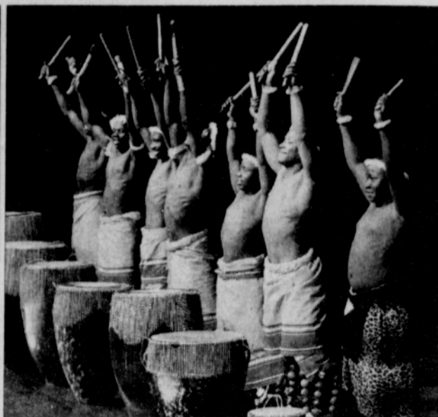
The Children of Uganda perform at the Nike campus in Beaverton. Acting as goodwill ambassadors to increase global awareness of HIV/AIDS, they play a variety of handmade instruments and perform dances from a number of African countries.

Children of Uganda, the award-winning dance troupe comprised of 20 Ugandan children orphaned by HIV/AIDS, performed at the Nike campus in Beaverton last Wednesday. The performance was part of a 17 city U.S. tour projected to raise $1 million to support orphans in Uganda while increasing global awareness of AIDS and its devastating impact on children.