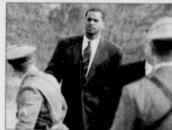
Jayson Williams arrives at the New Jersey State Police barracks Monday to surrender in connection with the shooting death of a limousine driver.