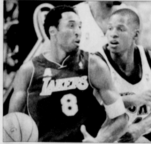
Michael Jordan got a lot of media attention in the NBA All-Star game Sunday, but it was Laker Kobe Bryant (far left) who won the game MVP award.

Players, fans and everyone else gasped in disbelief while Jordan