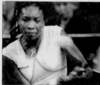
Venus Williams returns a backhand in this AP photo.

"I wasn't able to move this morning," Dokic said Sunday. "It seems to be a lot more serious