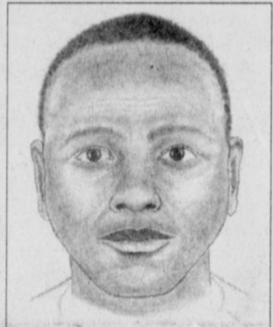
Police hope someone can identify this man, a suspect in the December murder of a northeast Portland teenager. The sketch was drawn after a 1997 assault with similar circumstances.

Portland police are continuing to follow leads in the murder and sexual assault of a northeast Portland teenager, but so far no arrests have been made.