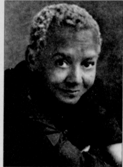
Nikki Giovanni, is one of the most important, honored and beloved figures in American literary circles. She will be speaking at the 6 th annual Clark College Women's Conference on Saturday, Feb. 9, from 8:30 a.m. - 4 p.m. in Gaiser Hall. For more information, call 360-992-2366.