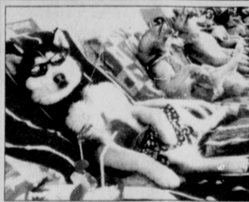
Taking in the good life, the sled dogs relax in a dream.