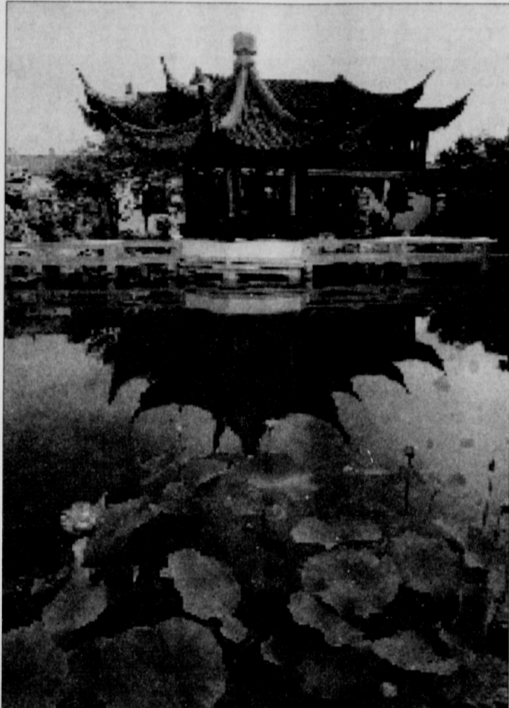
To recognize the Year of the Horse, a series of cultural events will be held for the whole family at the Portland Classical Chinese Garden.

Portland Classical Chinese Garden welcomes the Year of the Horse with a multi-layered Chinese New Year celebration, Feb. 12 - March 3. During the first week, the first 100 visitors each day during the celebration will receive hong bao, a traditional New Year's gift.