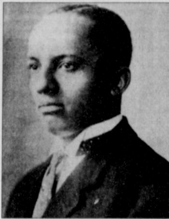
Carter G. Woodson founded Black History Month in 1926.

According to Woodson, "The accounts of the successful strivings of Negroes for enlightenment under most adverse circumstances reads like beautiful romances of a people in an heroic age."