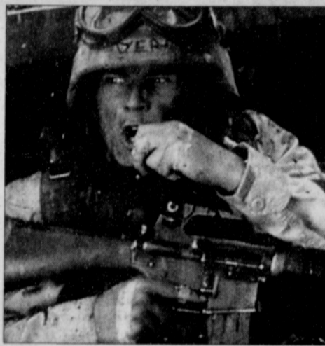
Josh Hartnett plays Eversmann on a special peacekeeping mission in Somalia in "Black Hawk Down."

Based on actual events, "Black Hawk Down" is the heroic account of a group of elite U.S. soldiers sent into Mogadishu, Somalia in Oct. 1993 as part of a U.N. peacekeeping operation. Their mission: to abduct several top lieutenants of the Somali warlord, Mohamed Farah Aidid, as part of a