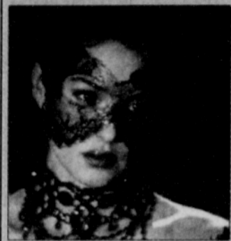
Monica Bellucci plays the victim of a mysterious beast that ravishes a French countryside in the upcoming movie, "Brotherhood of the Wolf."

Inspired by actual events that took place during the reign of King Louis XV, this film revisits the myth of the "Beast of Gévaudan," which supposedly killed a string of peasants in south France. (Genre: foreign, action; Rating: R; Running time: 2 hrs. 22 mins.)