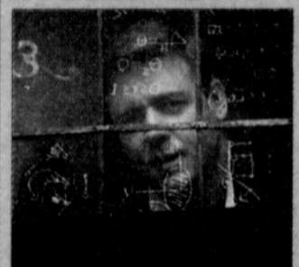
Russell Crowe plays the true life story of mathematical genius John Forbes Nash, from his school days at Princeton to winning the Nobel Peace Prize and then becoming a delusional schizophrenic.

The film is inspired by events in the life of John Forbes Nash, Jr., and in part based on the biography "A Beautiful Mind," by Sylvia Nasar. (Genre: historical, psychodrama, romance, adaptation, biopic, drama; Rating: PG-13; Running time: 88 mins.)