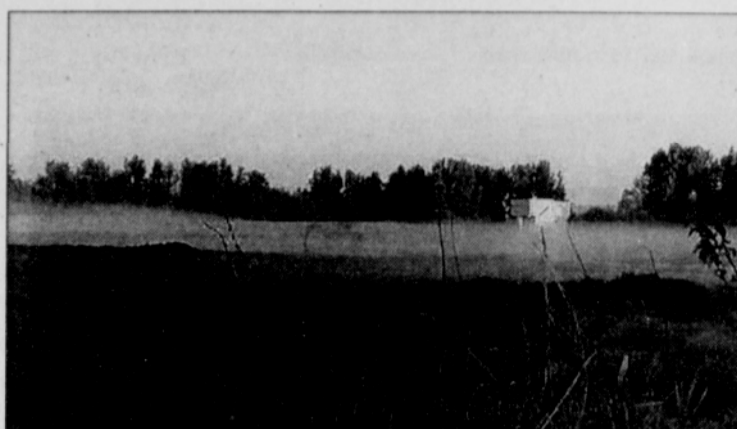
The Vanport wetlands project returns 91 acres of the old K-G-W radio transmission towers property to its historic wetlands habitat.

The Port is in the process of returning 91 acres of the old K-G-W radio transmission towers