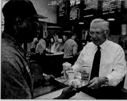
Dave Thomas, the founder of Wendy's Old Fashioned Hamburgers, also served food as the restaurant chain's advertising spokesman.

The founder and senior chairman of Wendy's International became a household name when he began pitching his burgers and fries in television commercials in 1989. The smiling Thomas, always wearing a white short-sleeved shirt and red tie, touted the virtues