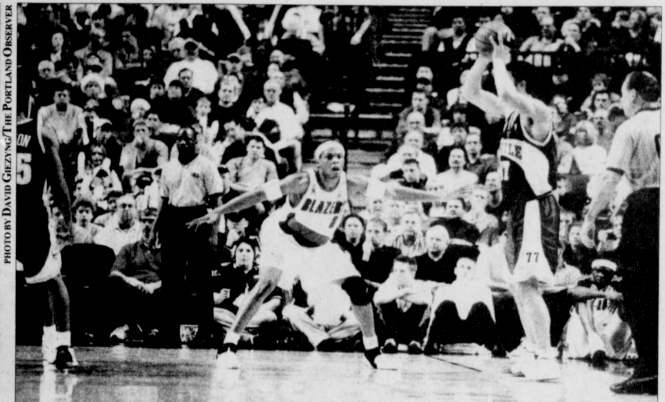
Premiere Forward Bonzi Wells of the Portland Blazers has always had the support of his local fans; but told Sports Illustrated "The fans don't matter."