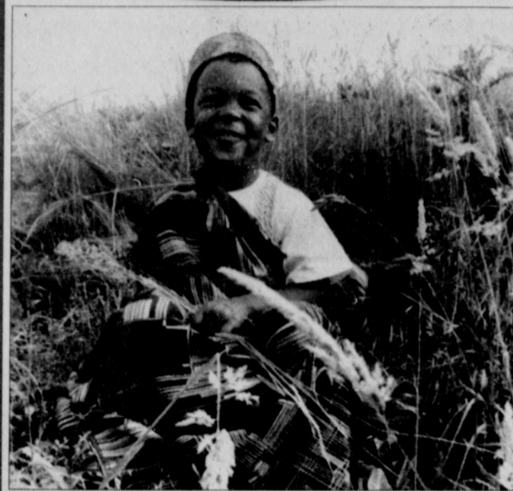
In celebration of the seven principles of Kwanzaa, the Interstate Firehouse Cultural Center, located at 5340 N. Interstate, will be having a multi-artist exhibition until the end of the month. To recognize creativity on the last day of Kwanzaa, IFCC will be offering music, ceremony and a feast. For more information, call 823-2072.