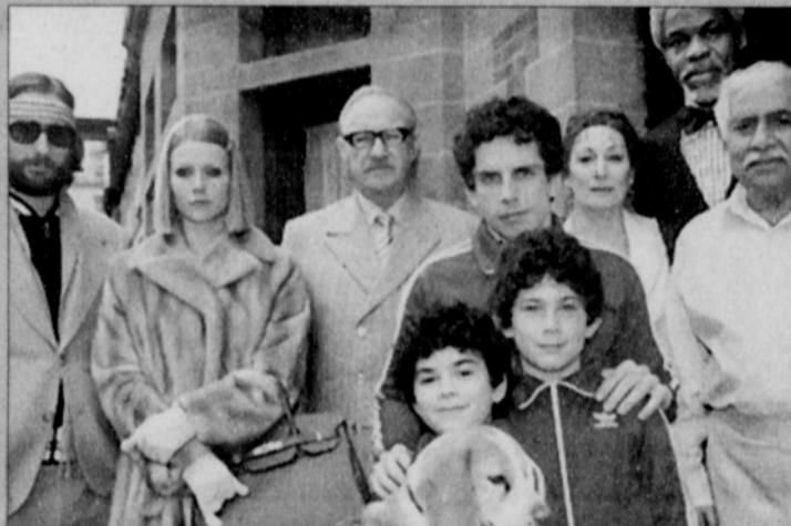
A family of eccentric geniuses reunite unexpectedly after a long separation in "The Royal Tenenbaums."

Royal Tenenbaum and his wife Etheline have three children—Chas, Margo and Richie—a family of geniuses. Chas started buying real estate in his early teens (having a seemingly preternatural understanding of international finance), Margot was a playwright (who received a Braverman grant of $50,000 in the ninth grade) and Richie was a junior champion tennis player (who won the U.S. Nationals three years in a row). Each genius' ability appeared unparalleled until Royal and Etheline separated and virtually all memory of the Tenenbaum brilliance was subsequently erased. The tale follows the family's sudden and unexpected reunion one winter. (Genre: comedy; Rating: R; Running time: 90 mins.)