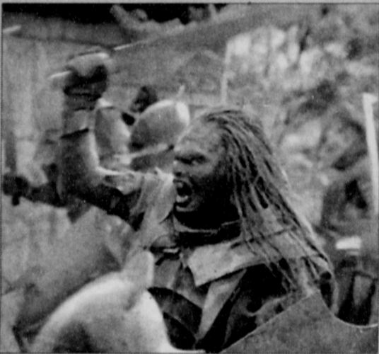
Uruk-Hai, an army of horrible mutants battle for blood in "The Lord of the Rings."

Set in mythic pre-historic times, the story of a desperate battle against encroaching evil unfolds. It pits young hobbit Frodo, who has inherited a magic ring from his elderly cousin Bilbo, against the dark Lor Sauron. Wise to the powers that the magic ring holds, Sauron desires it, knowing its power will enable him to enslave the people of Middle Earth. In an effort to thwart Sauron, Frodo recruits the fellowship of the wizard, an elf, a dwarf and others on a mission to destroy the ring so no being can misuse it; however, by casting it into the volcanic fires in the Crack of Doom, the ring unleashes its own power in the struggle. (Genre: epic, adaptation, live-action, fantasy; Rating: PG-13; Running time: 87 mins.)