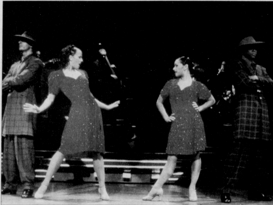
Having some friendly competition, "Swing" dancers show their stuff as they try to top each other.

The original Broadway Musical "Swing!" will play Keller Auditorium for eight performances, Jan. 1-6. For tickets and information, call 241-1407 or go online to www.portlandopera.com .