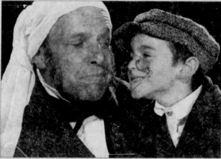
Tiny Tim befriends Scrooge in the timeless classic, "A Christmas Carol." The play runs at the Newmark Theatre, located at 1111 SW. Broadway, until Monday, Dec. 24.