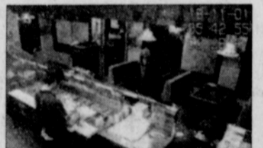
A surveillance camera shows a suspect for the robbery of a Subway store.

The suspect, who carries and displays a black colored handgun inside his coat, is described as a male white in his twenties, 5'7" to 5'9", 160 to 180 pounds, with