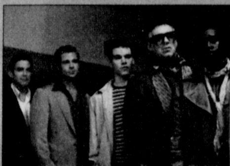
A new generation of actors remake Frank Sinatra's 1960 film on multiple casino heists in "Ocean's Eleven."

Danny Ocean and his hand-picked crew of specialists gather in Las Vegas to attempt the most extravagant casino heist ever: they plan to rob the Bellagio, the Mirage, and Treasure Island simultaneously. In this remake of the classic Frank Sinatra film by the same name (regarded as one of the best the infamous "Rat Pack" ever made), there are a few modern-day differences. (Genre: action, adventure, comedy, crime, remake; Rating: PG-13)