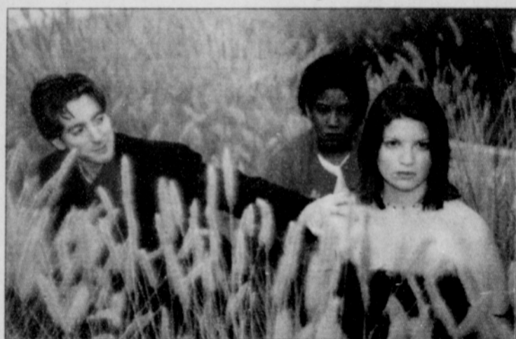
Family life gets turned upside down when a deceitful man pays a visit in "Tartuffe."

"Tartuffe: The Visitor" tells the story of a household turned upside down by a pious visitor who demands moral obedience from his host family—all the while conducting himself in quite a different manner. The story of virtue, vengeance and fanaticism is by turns hilarious, startling and disturbing as one family reckons with its own responses to their visitor's influence.