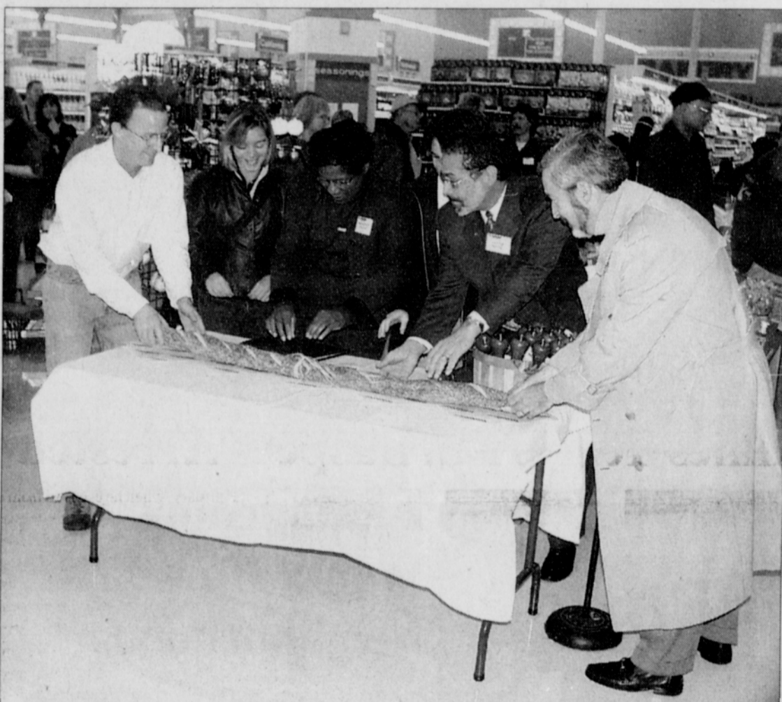
Neighbors and dignitaries symbolically break bread - sharing a loaf of baguette bread several feet long - during last week's grand opening of the New Seasons Market, a locally owned and operated store at 5320 N.E. 33 rd .