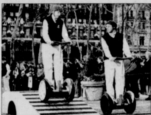
An inventor shows off his gyroscope-stabilized, battery-powered scooters that he hopes will replace cars in the city.

The two-wheeled Segway, which looks like a