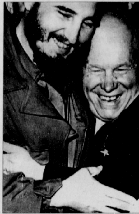
Cuban president Fidel Castro with Soviet leader Krushchev in better times before the Cuban Missile Crisis erupted.

MIAMI (AP) — The family of an American killed by a Cuban firing squad in 1961 filed a wrongful-death lawsuit in hopes of winning financial damages under a 5-year-old federal law.