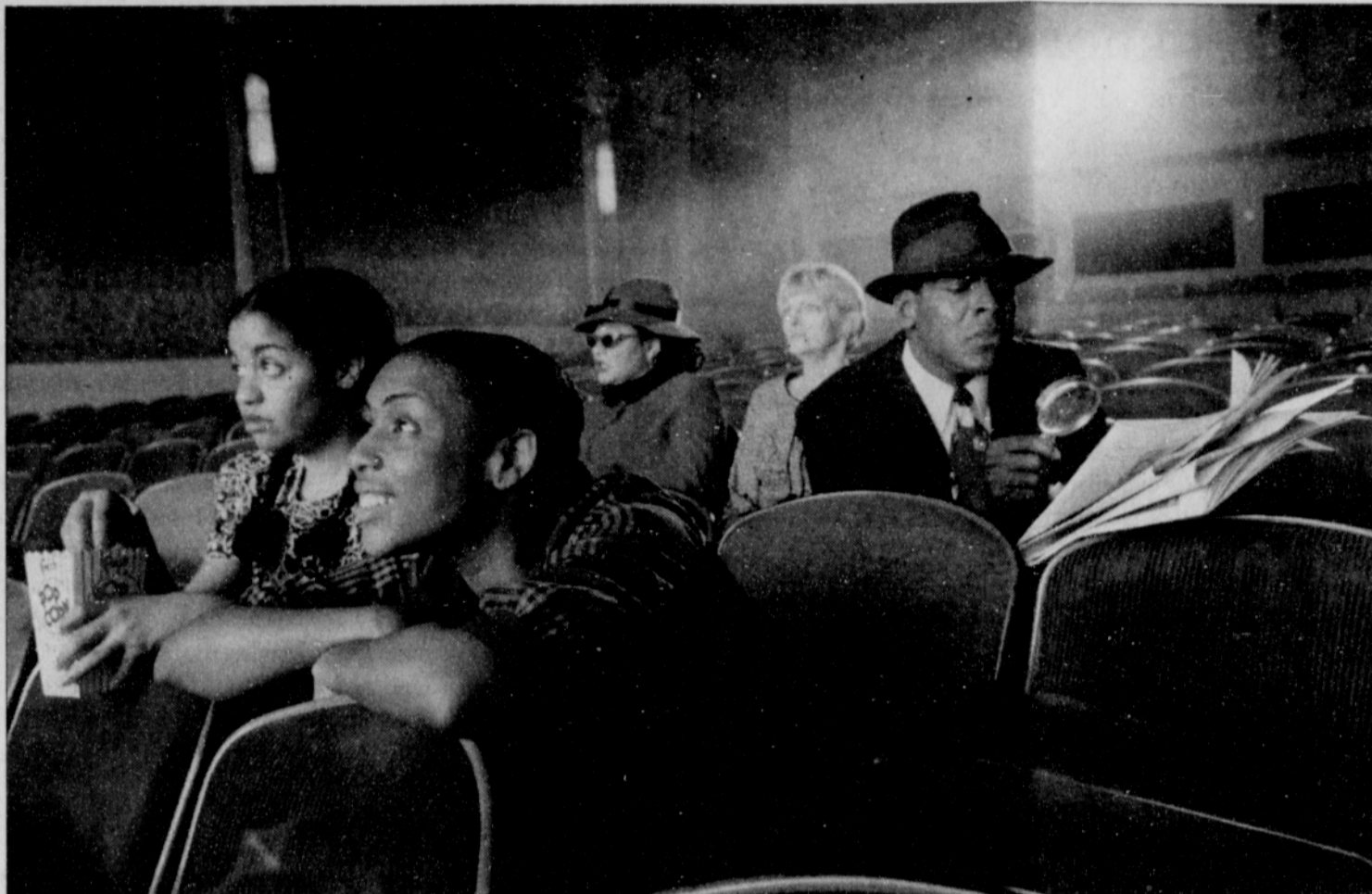
As a historical period piece, "Crumbs from the Table of Joy" dramatizes the Black community during the 1950s on the cusp of the civil rights movement, McCarthyism and a war.

The Artist Repertory Theatre continues its season with a heart-warming new American play, "Crumbs from the Table of Joy." It chronicles the life of a young girl coming of age and the black migration to the North during the 1950s.