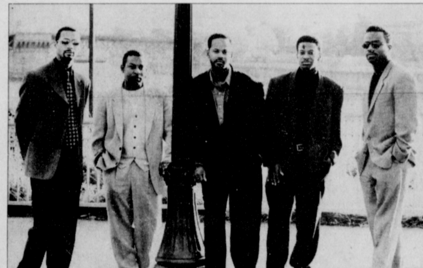
N-Touch, the local favorite Jazz and R&B band recently released their new CD entitled "N-Touch." They will be performing at Billy Reed's Restaurant & Bar in the Side Room, located at 2808 NE Martin Luther King, Jr. Blvd., on Friday, November 16, from 10 p.m. - 1 a.m.

Harry Potter has spent most of his short life living under the Dursley house stairs where his aunt, uncle and cousin treat him worse than vermin. Harry is unaware of his special wizard heritage until one day when he receives an invitation to study at Hogwart's School of Witchcraft and Wizardry. Harry has to believe this opportunity will surpass his dreary existence in the world of ordinary humans (called Muggles by wizards), so he enrolls in the school and is surprised by the magic and fantasy he uncovers. (Genre: adaptation, children's magic, family; Rating: PG)