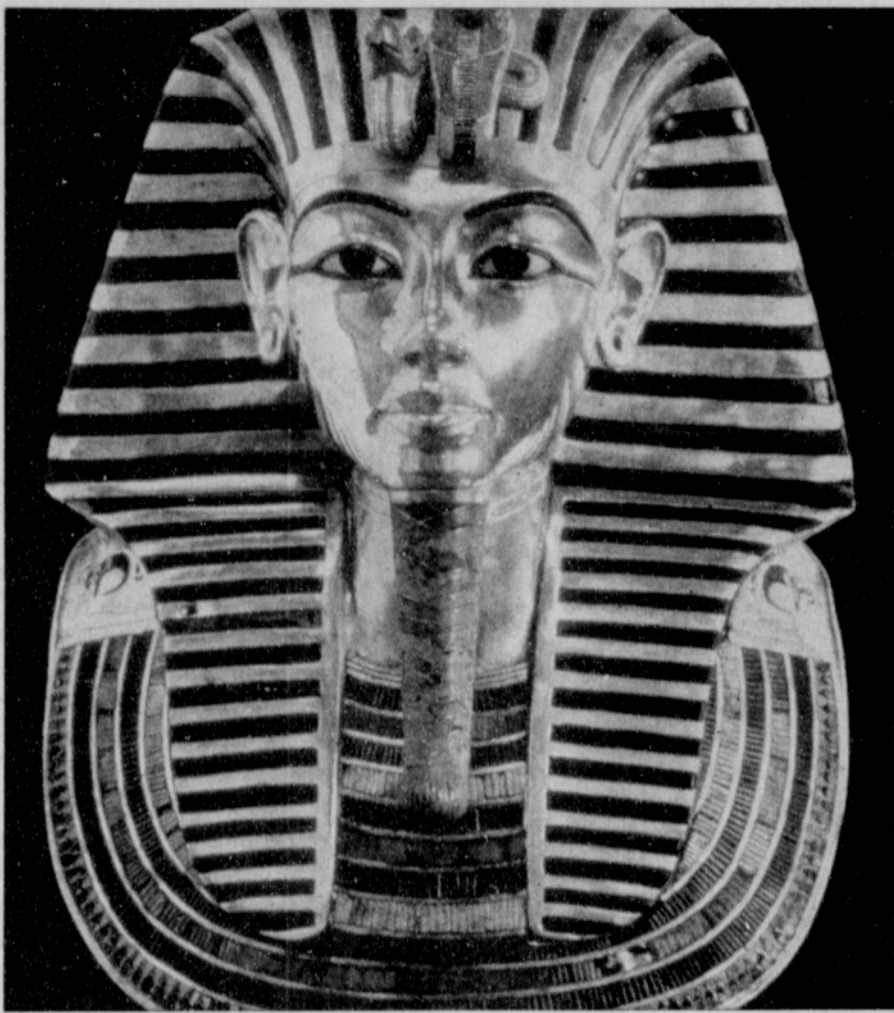
"Mysteries of Egypt" transports viewers to the time when the great pyramids were built, recreating the scenes as archaeologists now believe they occurred.

For the first time ever, the Oregon Museum of Science and Industry's Omnimax Theatre is bringing back six of the most popular large screen films shown. Called "A Really Really Big Film Festival," it runs through Jan. 16, 2002.