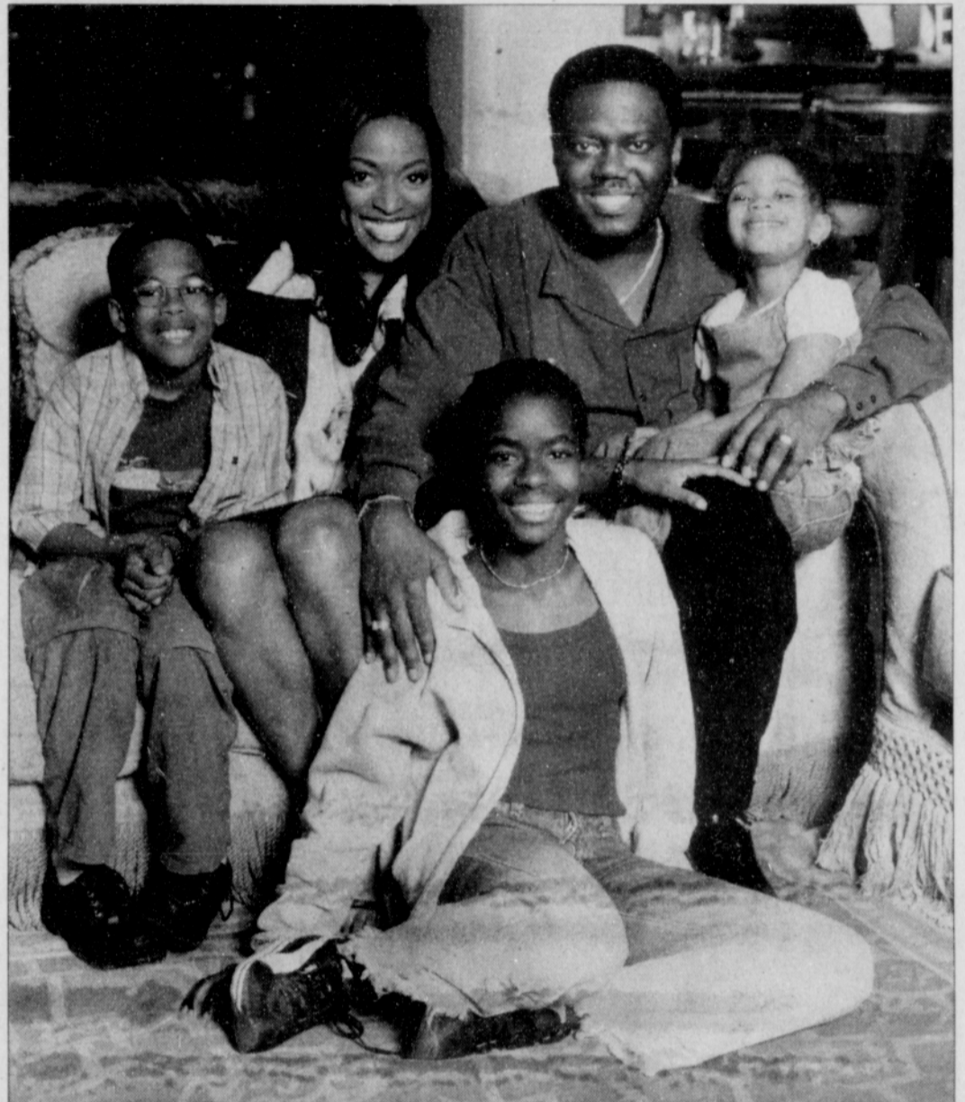
Inspired by the real life of comedian Bernie Mac, "The Bernie Mac Show" is a daring new half-hour comedy for the whole family that premieres on Wednesday, Nov. 14 on FOX. In the show, Bernie suddenly finds himself the guardian of his sister's three young children; He combines tough love with a unique and comedic view on parenting. In trying to do the right thing, he doesn't always do the right thing.