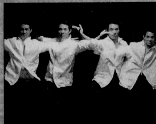
Jet Li demonstrates his martial arts mastery in "The One".