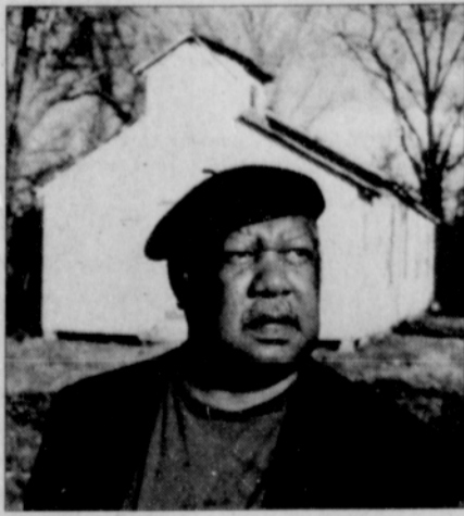
Ernest J. Gaines has helped shape a changing society in Louisiana and the entire American South.

family to be born on the River Lake plantation in Pointe Coupée Parish, La.