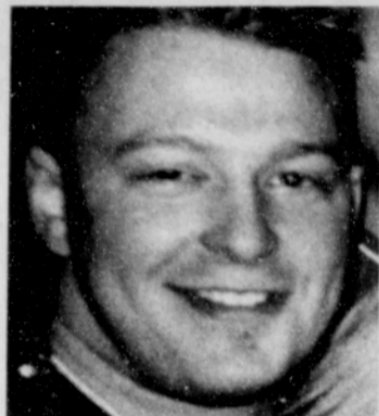
Police would like to hear from anyone who may know this man's true identity.

On March 21, a Port of Portland police officer stopped a car in which the suspect was a passenger. The individual appeared to be under the influence of drugs, and the officer located what was believed to be cocaine under the seat. The suspect was cited for possession of a controlled substance and released.