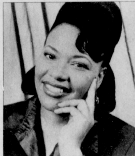
Like her father, Dr. Martin Luther King Jr., Rev. Bernice King has a reputation as a powerful and motivating orator.

A lawyer and social activist, King served in the Fulton County Juvenile Court system under Judge Glenda Hatchett, mentored fifth-grade girls in an inner-city school, organized