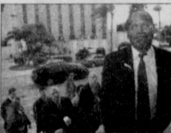
O.J. Simpson heads to trial in Miami to face a road rage charge.