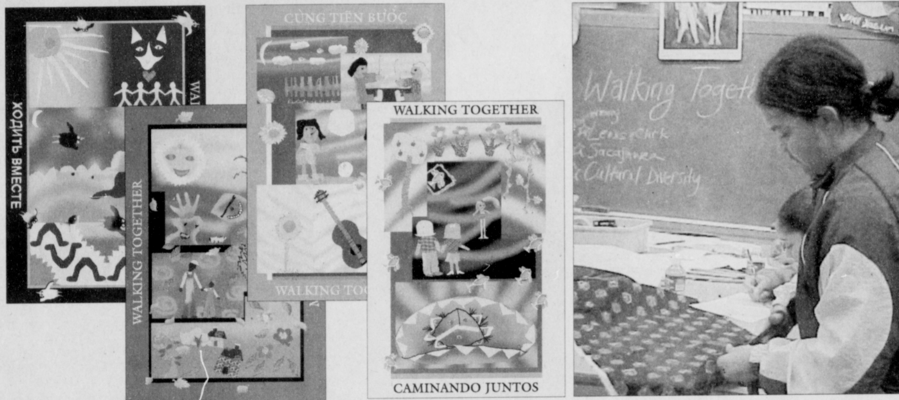
These four banners are the final projects created by local senior citizens and school children to honor the diversity of cultures and backgrounds in the Portsmouth and University Park neighborhoods. Each banner says "Walking Together" in English, Hmong, Russian and Spanish.