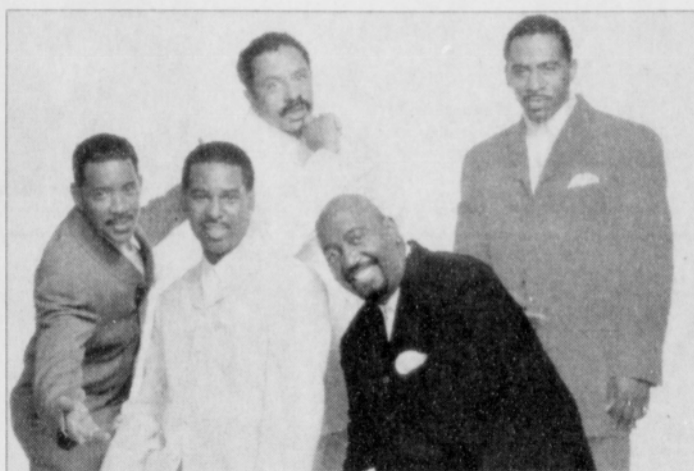
The legendary Temptations will sing at the Arlene Schnitzer Concert Hall on Oct. 10, covering 40 years of their chart-topping musical hits.