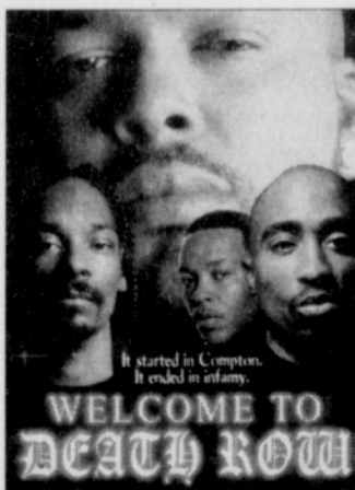
In 1993, Death Row Records exploded onto the music scene with their “Gangsta Rap.” The label made superstars out of Dr. Dre, Tupac Shakur and Snoop Doggy Dogg – releasing an unprecedented six consecutive multi-platinum albums.

A controversial film, “Welcome to Death Row” documenting the dizzying rise and equally dramatic fall of Death Row Records, the label which effectively launched the “gangsta rap” music genre, is now available in video stores nationwide.