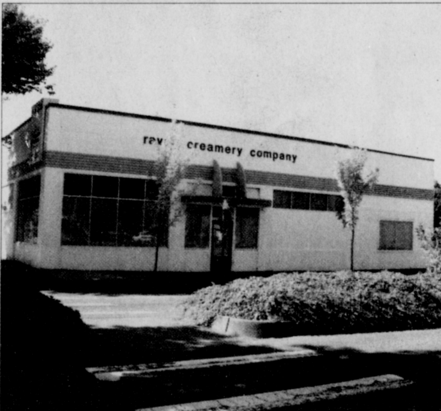
The site of the former Raven Creamery, slated to become site for a new McDonald's restaurant.