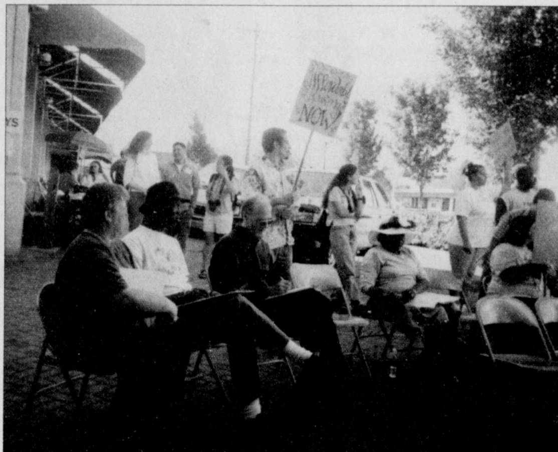
People wanting to keep their neighborhoods affordable rally in northeast Portland.

Displacement occurs when people are forced to move out or away from their neighborhoods because of the rising cost of housing. It commonly forces the poor, working class residents, most often people of color, immigrants and elderly to move