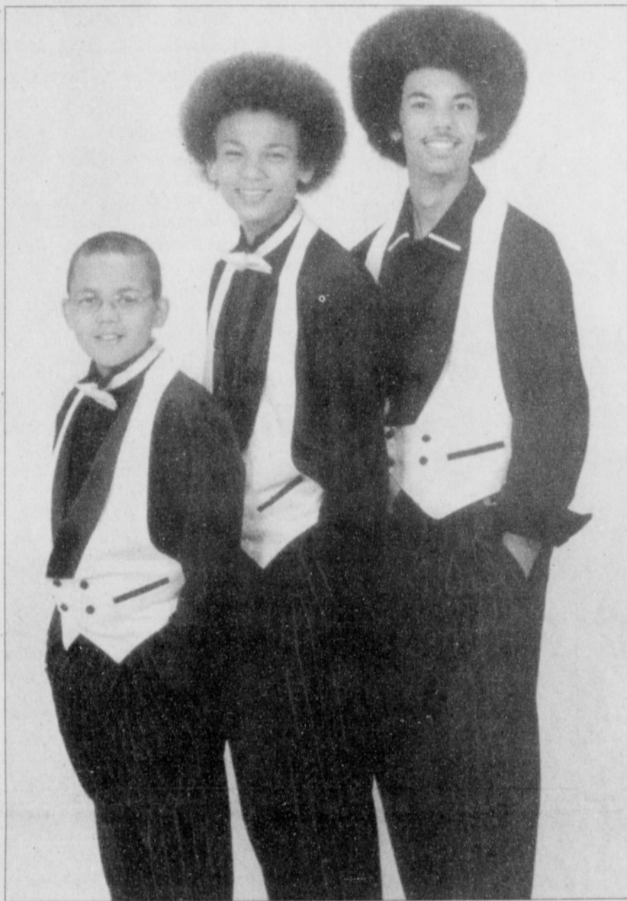
The Hot Shot Tap Dancers, the Ambassadors of Tap, are one of the many entertainment groups scheduled to perform this weekend at Portland International Airport in a public party to celebrate the new Airport Max light rail, a revamped terminal lobby and new concourse.

The new Airport MAX Red Line runs every 15 minutes, traveling directly to