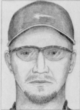
A sketch of a burglary suspect.