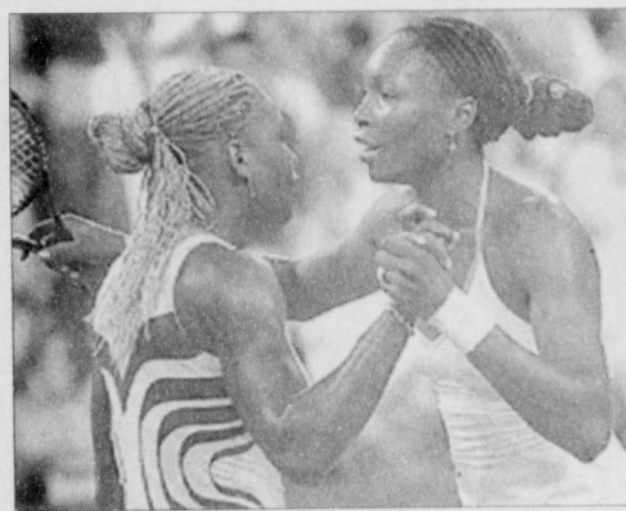
The Williams sisters after a grueling face-off. Venus Williams (right) proudly holds up her U.S. Open Cup while Serena looks on.

She earned it with an 103 mph average first serve, five mph faster than Serena Williams.