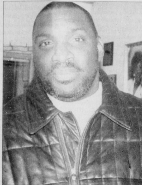
Grambling State Coach Doug Williams