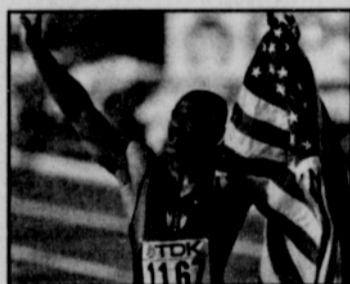
Maurice Green won the 100-meter with the third-fastest time in history - in 9.82 seconds at the Track and Field World Championships in Edmonton, Alberta. Green shook off false starts by three of his opponents in the 100-meter dash to win his third consecutive world title.

In winning, Greene led a 1-2-3 U.S. finish, with Tim Montgomery second at 9.85 and Bernard Williams third with a ca-