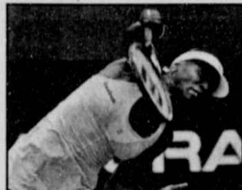
Venus Williams served up 13 aces against Monica Seles to win 6-2, 6-3 and capture the title in the Acura Classic.

Playing just her second tournament since May, Seles reached the final by upsetting the top two players in the world. She beat No. 2 Jennifer Capriati in the quarterfinals, then No. 1 Martina Hingis in the semis.