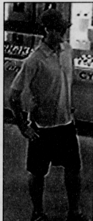
Store surveillance video shows an armed robbery suspect.

around the movement. Crime Stoppers is offering a cash reward of up to $1,000 for information, reported to Crime Stoppers, which leads to an arrest in this case, or any unsolved felony crime, and you can remain anonymous. Call Crime Stoppers at 503-823-HELP.