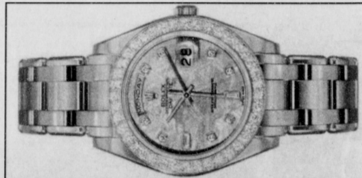
An expensive Rolex watch is taken during a daring robbery.

The suspect is described as a white male, 20 to 25 years of age, 6'1" tall, with a slim build, dark blond/light brown hair, and a slight mustache. He was wearing a