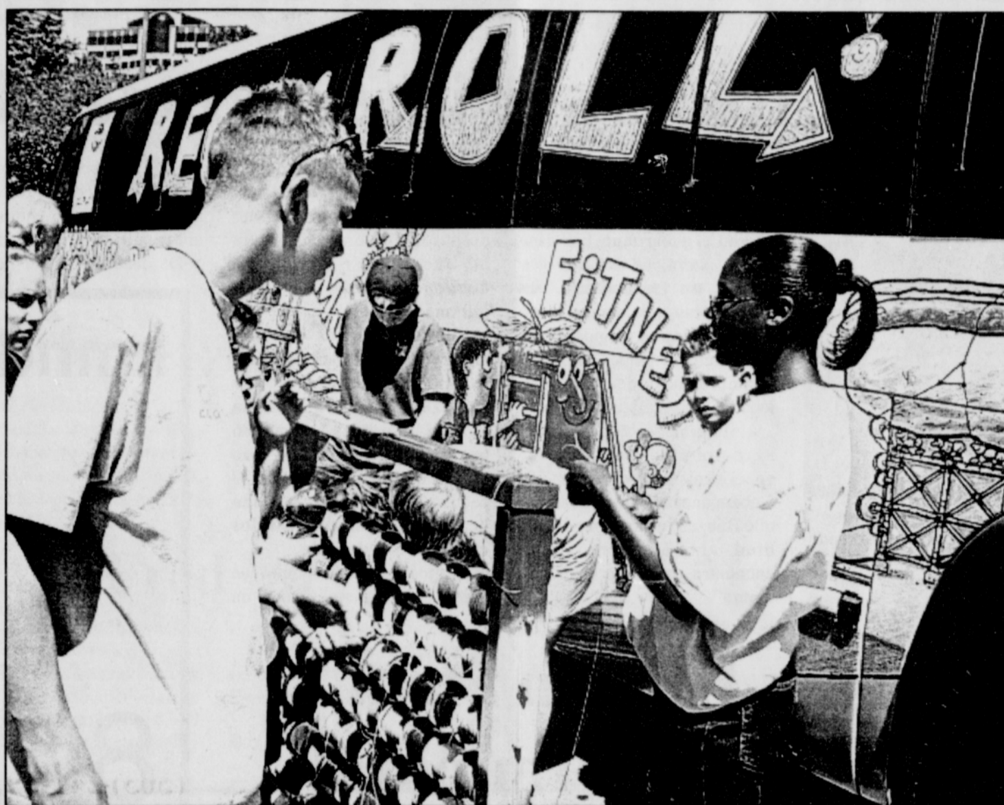
The Portland Parks and Recreation Department's new "Rec N Roll" bus, with its portable arts and crafts, sports and other activities, draws a lot of interest while parked at the downtown waterfront. The bus has been a huge success this summer, drawing kids to area parks where normally no summer activity programs are available.