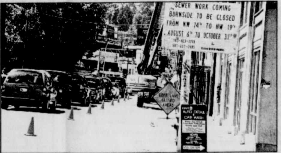
Motorists are advised of the pending closure of West Burnside for installation of a big pipe to divert Tanner Creek from the city's combined sewer flow.

Monday, West Burnside Street, between 14th and 19th Avenues, will close to construct a segment of the Tanner Creek Stream Diversion project.