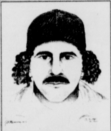
A sketch identifies a suspect in an assault.

The suspect is described as a white male, approximately