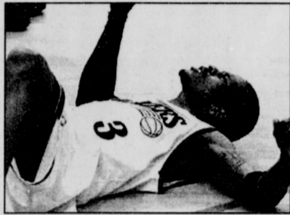
Philadelphia 76ers' Allen Iverson lies on the floor toward the end of game 3 of the NBA finals against the Los Angeles Lakers in Philadelphia. The Lakers defeated the 76ers 96-91 to take a 2-1 lead in the series.

is affecting his offense. "I'm playing more minutes and I've had a