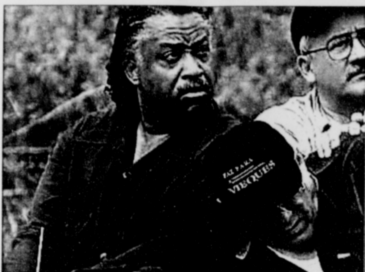
Rev. Al Sharpton (left) trespasses onto a Navy base in Vieques, Puerto Rico to protest bombings on the site.