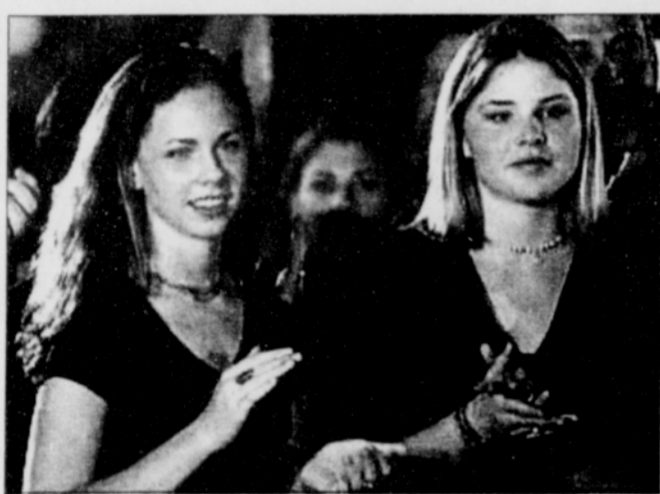
Barbara (left) and Jenna Bush.

Both are Class C misdemeanors under the Texas Alcoholic Beverage Code and carry a fine of up to