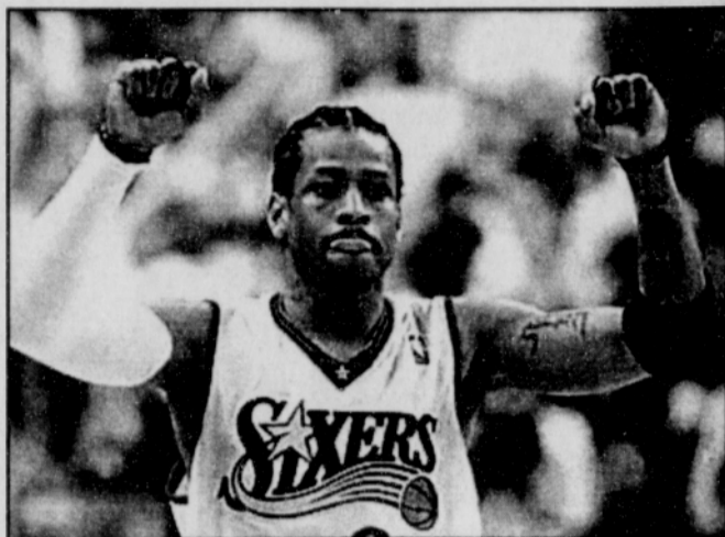
Allen Iverson leads his 76ers into the NBA Finals against the Lakers.

The Sixers have been proving people wrong since they began the season with a