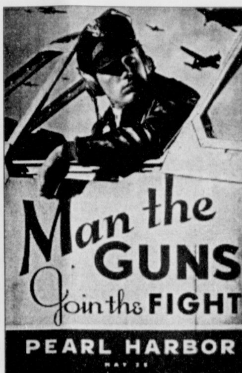
"Pearl Harbor," the movie debuts featuring stunning battle scenes at the port at Pearl Harbor, Hawaii's most important

base for the United States' Pacific Fleet. The military site became the target for one of the great tragedies in American military history.