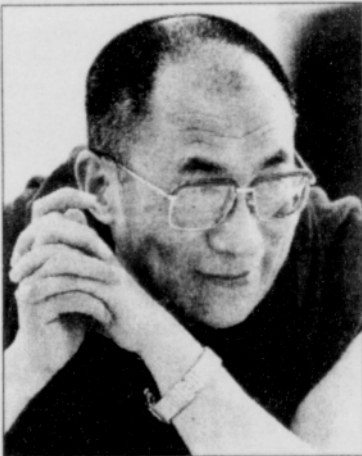
The Dalai Lama will be in Portland from May 13-15 to spread his universal message of tolerance, mutual respect, and compassion.

His Holiness the 14 th Dalai Lama was born in a small Tibetan village called Takster on July 6, 1935. In accordance with Tibetan tradition,