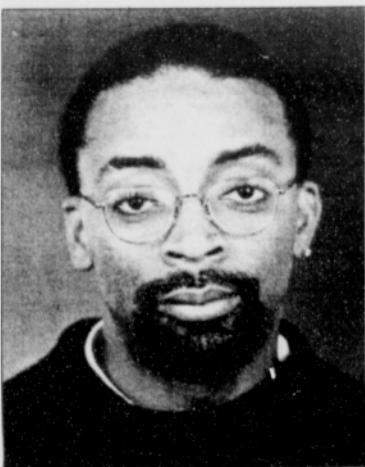
Spike Lee, Director

"A Huey P. Newton Story" is a virtuosic and intimate portrait of Huey P. Newton, the late co-founder of the Black Panther Party for Self Defense. Adapted from Smith's Obie Award winning off-Broadway solo performance of the same name, Lee brings the play from the stage to the screen as only he could.