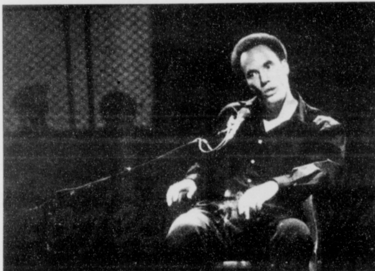
Actor-writer-creator Roger Guenveur Smith brings his signature solo theater performance to the screen, starring as Huey P. Newton in the BLACK STARZ! Original production of "A Huey P. Newton Story."