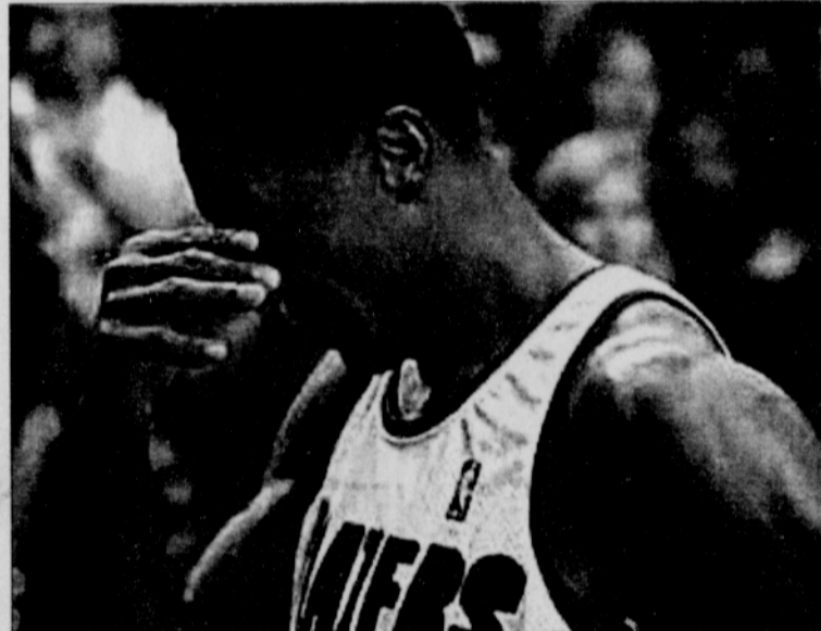
The Los Angeles Lakers were too much for the Trail Blazers as they rolled to a 3-0 game victory to end the season for Portland.

"This is the worst — the worst thing I have ever had to deal with throughout my career," Pippen added. "It just wasn't a fun season for us. The outcome of it was just a testament to what we had been dealing with all season."