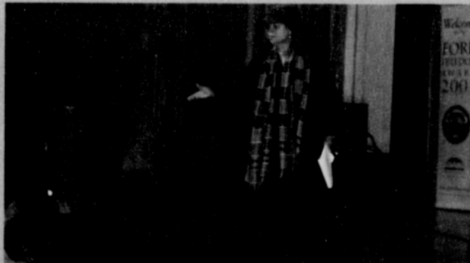
Sonia Sanchez, 2001 Ford Freedom Award Lecturer, author, activist and professor, lectures to Detroit area students on staying positive, and staying in school at the 2001 Ford Freedom Award Lecture Ceremony held at the Detroit Opera House, Feb 23.