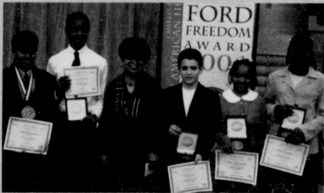
Sonia Sanchez, 2001 Ford Freedom Award Lecturer, author, activist and professor, with student essay winners from Metro Detroit area schools of the 2001 Ford Freedom Award program, sponsored by Ford Motor Company at the Charles H. Wright Museum of African American History, Feb 22.