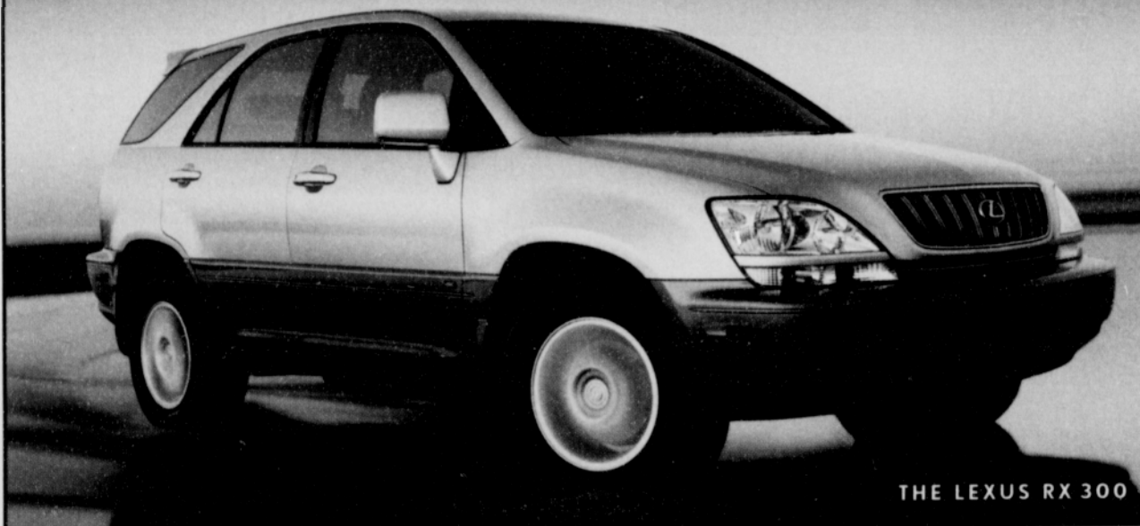
THE LEXUS RX 300

Now Save $1,500 On The RX 300 Lexus Value Package.†