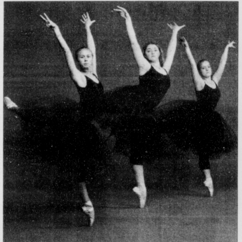
Now in its fifth year, the Modern Dance Lab at Jefferson will be giving an upcoming performance at the school.