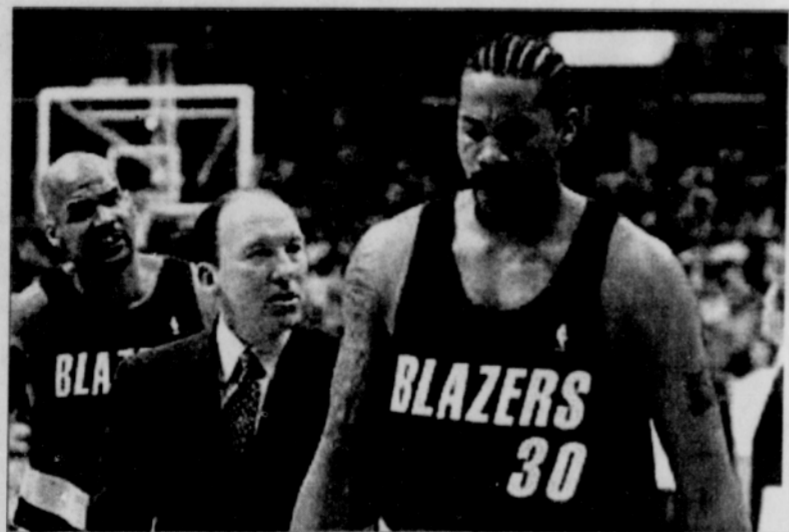
Rasheed Wallace leaves the court at the end of the first half after picking up a technical four for throwing the ball into the air and jawing with one of the officials.

O'Neal said he felt he had an off-game. "I don't usually shoot 7-for-21, that's a disgrace," he said. "They're