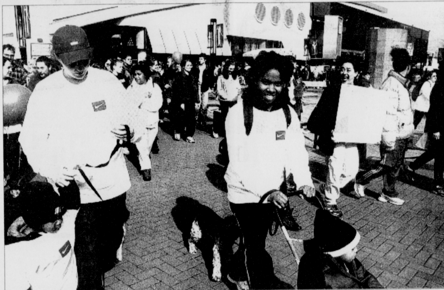
Hundreds of walkers meet at the Rose Quarter Commons area on Saturday for the Walk as One walk-a-thon. The National Conference for Community and Justice (NCCJ) sponsored the event in 24 cities nationwide to help dismantle bias, bigotry and racism.