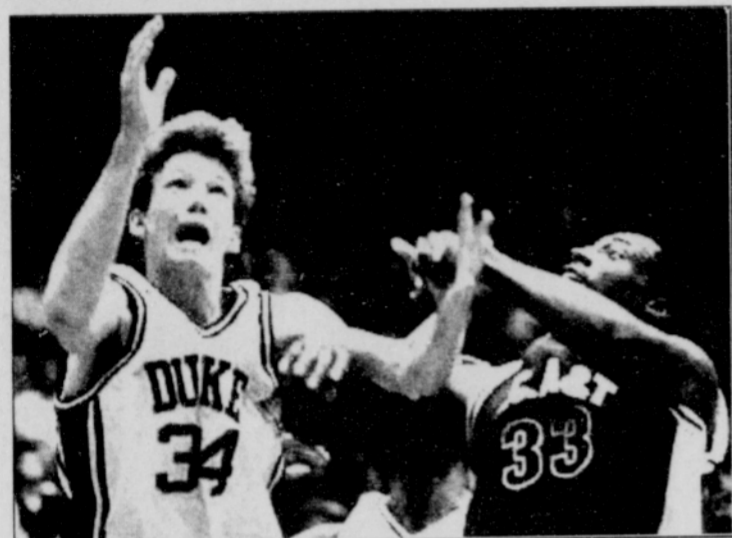
Mike Dunleavy Jr. leads his team to a national championship.

The Wildcats were attempting to defeat three No. 1 seeds for only the second time in NCAA history. The only other time was when Arizona won the title in 1997.